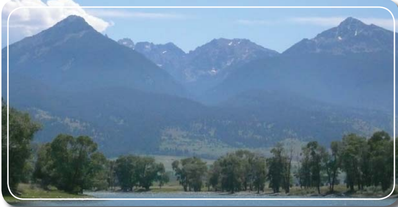
△ camp under the big sky

This program is an amazing opportunity to study wildlife with the U.S. Forest Service along the borders of Yellowstone National Park.