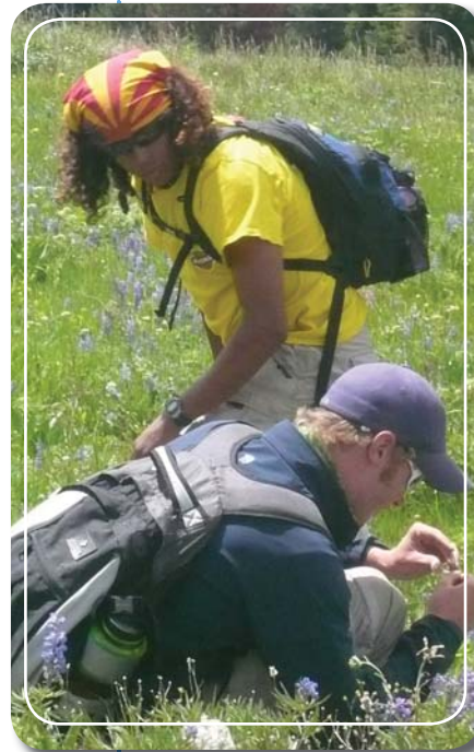
△ Investigate alpine ecology