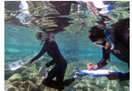
LOCAL STUDENTS IDENTIFY MARINE INVERTEBRATES IN THE GULF OF CALIFORNIA

In the Sierra Cacachila mountains, students partnered with researchers from the San Diego Natural History Museum to conduct reptile and amphibian diversity studies, and examined their adaptations for the harsh desert environment.