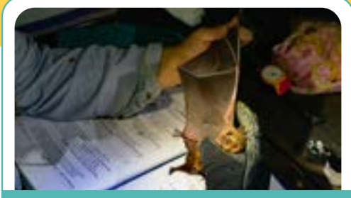
YOUR FIELD WORK

The country of Belize is home to incredible biodiversity. Its crystal-clear waters, swaying seagrass beds, and lush jungles offer critical habitat for bats, birds, unique mammals, and a host of marine life. On this field course, you'll investigate the diversity of these rich ecosystems both in the rainforest and on the coast.